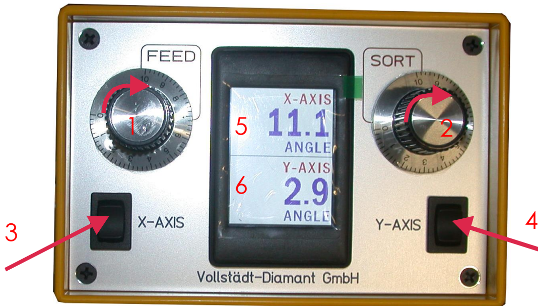
Fig. 5: Control unit